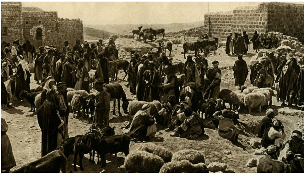
Bethlehem in the early 20th century